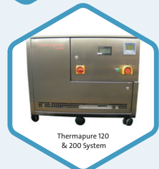
Thermapure 120 & 200 System