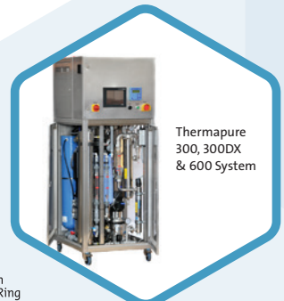
Thermapure 300, 300DX & 600 System