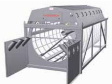
Type 2, Wing walls