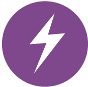
Reducing energy costs