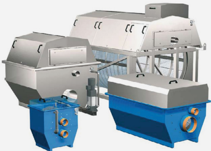
Picture showing a part of Hydrotech's wide drumfilter product line.

The Hydrotech Drumfilter is available in two drive system versions; direct drive and chain transmission. The direct drive is used on the two smallest drum sizes with 0.5 and 0.8 m drum diameter. The chain drive version is Hydrotech's well proven solution with filters in operation for more than 10 years.